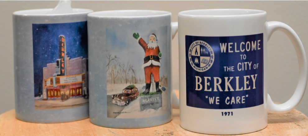
Coffee Mugs available at the Museum Gift Shop

Our best selling gifts/souvenirs are our Berkley Coffee Mugs with the Berkley Theater mug being our most popular. The Santa, on view during the Christmas season at Coolidge and Twelve Mile, is a popular choice during the Christmas Season, and the "WE CARE" mug is popular year around.